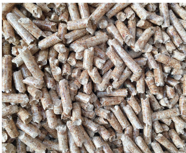
Figure 3 – Wood pellets