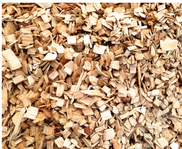
Figure 2 – Wood chips