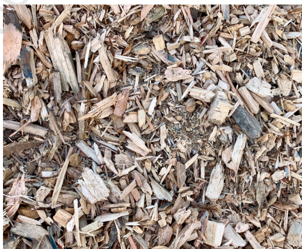
Figure 4 – Hog fuel